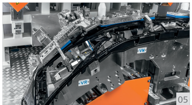
05 Support for the plant manufacturer (special machines or robot systems)