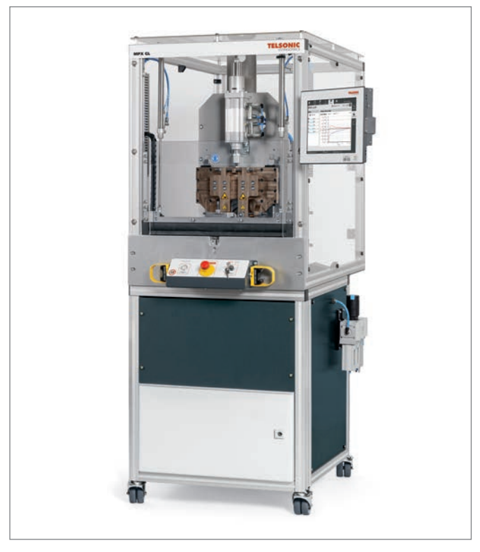
The application was realized on the MPX-TC ultrasonic welding system.